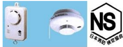
Hanging On walls

There are several brands of alarms. Usually fire alarms; hang on walls or to ceilings and cost about 3000 yen. Please get the products with a NS approval mark. This means they are certified by the Japan Fire Equipment Inspection Institute.